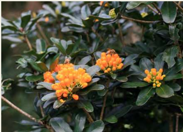
Saved from extinction but still critically endangered: Pittosporum tanianum

However, in 2002 two individuals of the plant were rediscovered by a botanist from the Southern Province's Direction of Natural Resources, then a third tree. In order not to take the risk of losing the species once again, cuttings were taken for its reproduction ex situ . It took a few trials before scientists were able to master the plant's reproduction, but by 2004 a technical guide was designed to ensure that the plant could be reproduced in nurseries. This plant is symbolic of the precarity of the dry forest. Although removed from the list of extinct species, it remains classified as critically endangered on the IUCN Red List and the necessary measures to secure its survival in the wild on the isle of Leprédour - including managing the populations of grazing deer, rabbits and rats - have not been effective. Although hundreds or even thousands of plants of the species have been produced and replanted in the Parc zoologique & forestier and in private gardens, the species remains at risk of extinction on its original site.