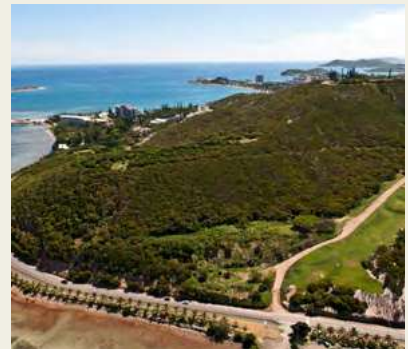
↓ Ouen Toro, Nouméa (South)