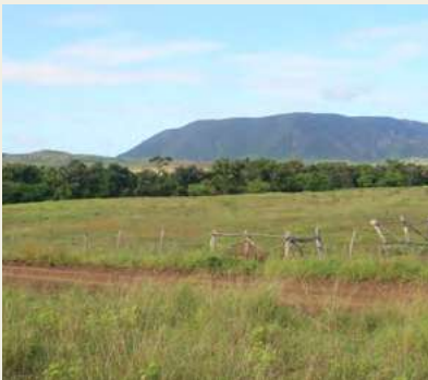
↓ Tiéa (North)